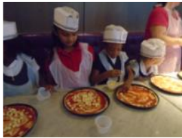
Year 6 at Cutty Sark on Friday 19 th October