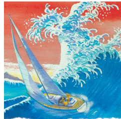
MICHAEL MORPURGO Kensuke's Kingdom

In addition we will be developing our mental maths skills through: chanting and practising all our times table facts, and the division facts that go with them, counting in various jumps from different numbers, and testing our mental maths agility using games and weekly tests.